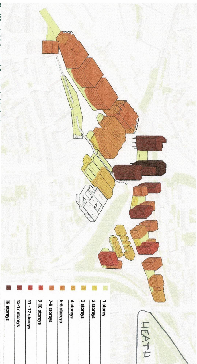
Fig. 483 – Aerial diagram of illustrative building heights