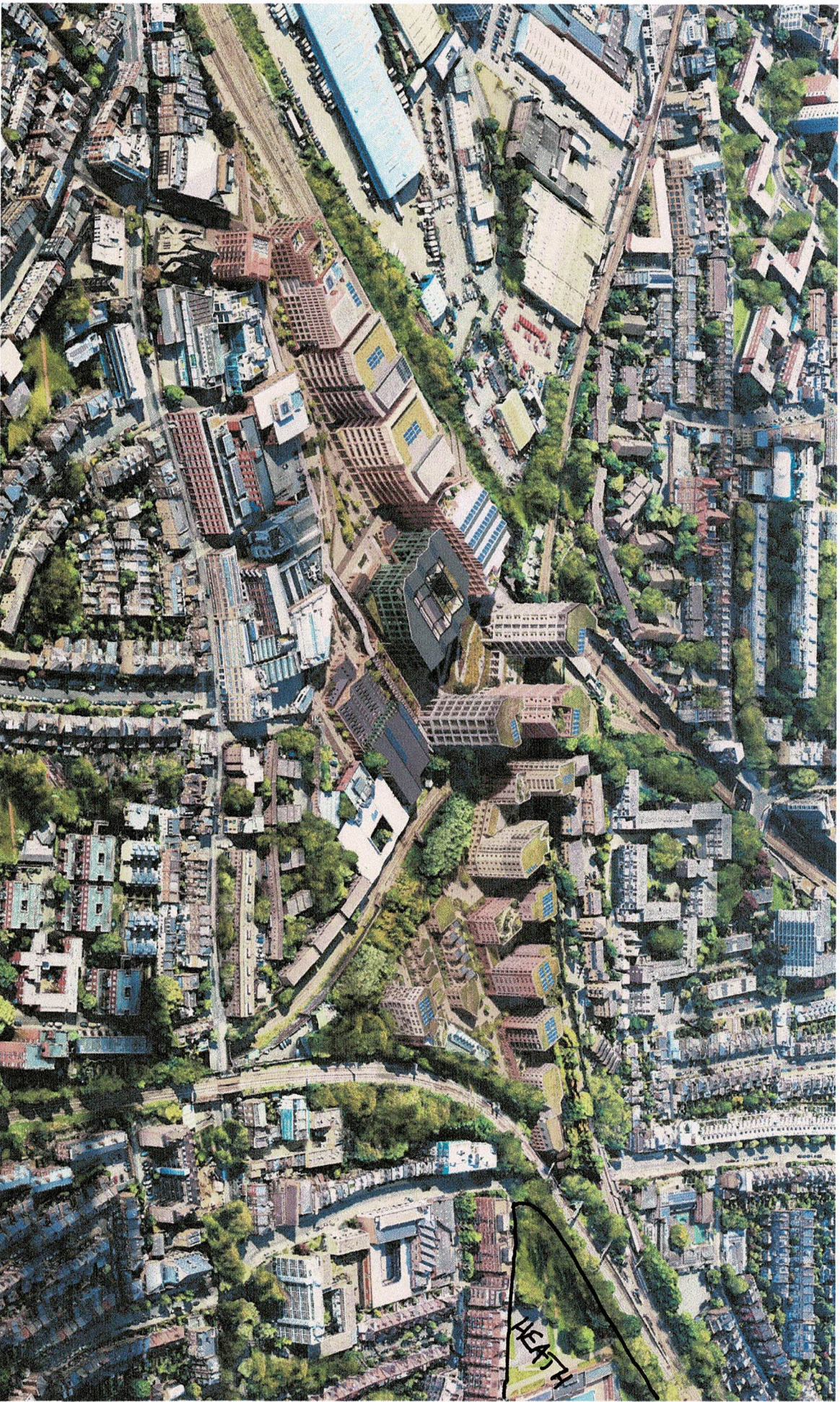
Fig. 504 — CGI showing an aerial view of the Murphy's Yard Illustrative Masterplan