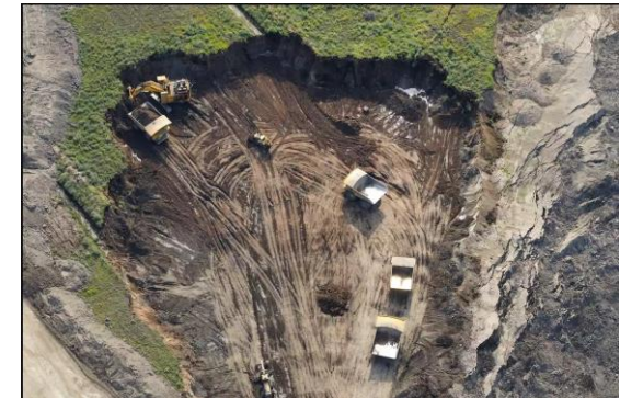
Alberta Tar Sands