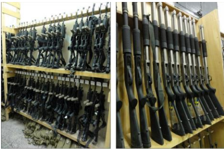
The Gurdian Apr 2004 Investing in Arms http://bit.ly/2FFh6Rq