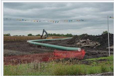
Dakota Access Pipeline being built in central Iowa